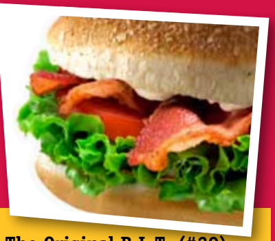
The Original B.L.T. (#20)

35 Gardenburger® All-natural, meatless patty topped with lettuce, tomato, mustard, pickles, and onion..... 5.75